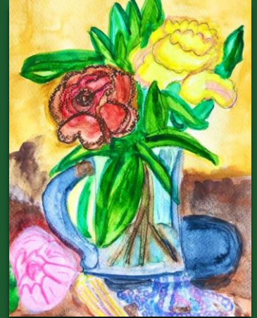
Art work provided by Nilay Nagle